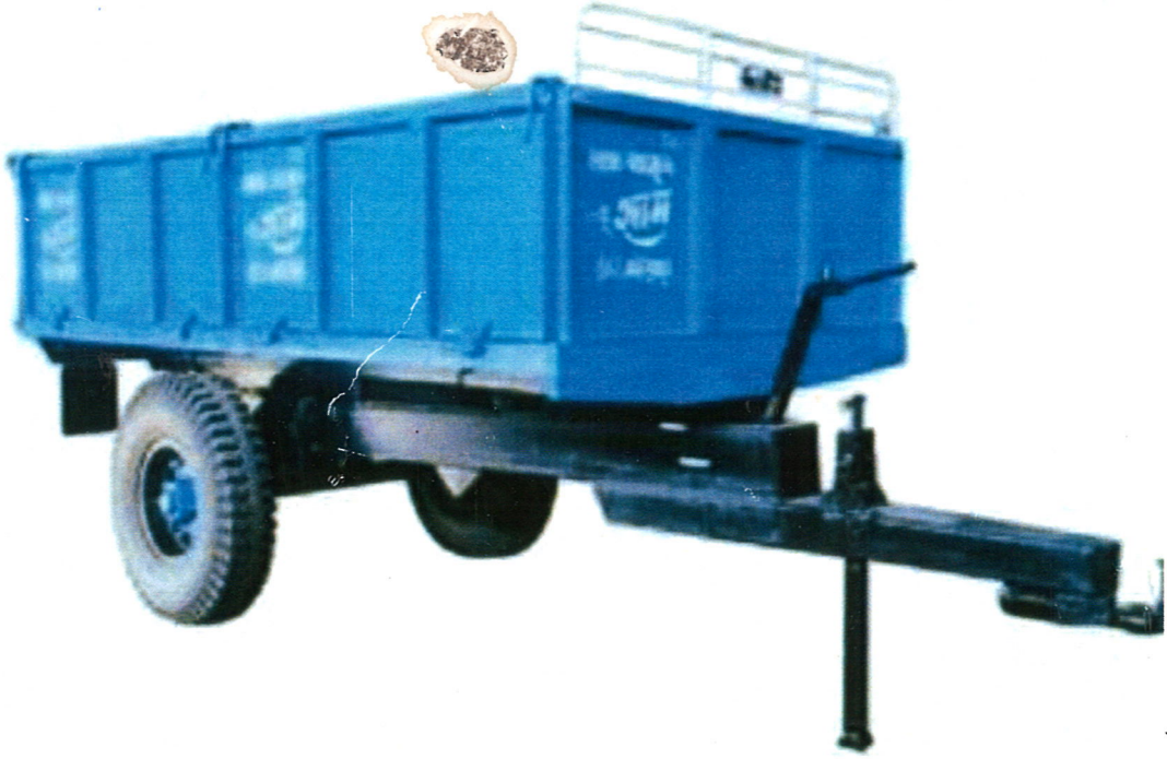
NEW SHAM INDUSTRIES NSI-3 TOT TIPPING TRACTOR TRAILER